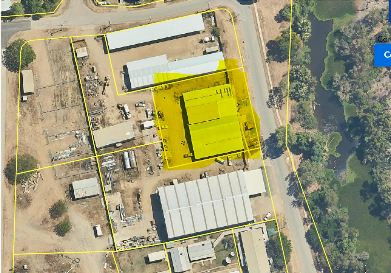
Map 1 – Mechanic's Workshop – Part of Lots 76 (Workshop)/ 77 (Heavy Plant Workshop) on SP272069 (licence area as highlighted)

The successful candidate shall enter into a standard terms licence agreement (draft attached Annexure A ) with Council over the Mechanic's Workshop for use of part of lots 76 (Workshop) and 77 (Heavy Plant Workshop) on SP272069 as highlighted in Map 1 .